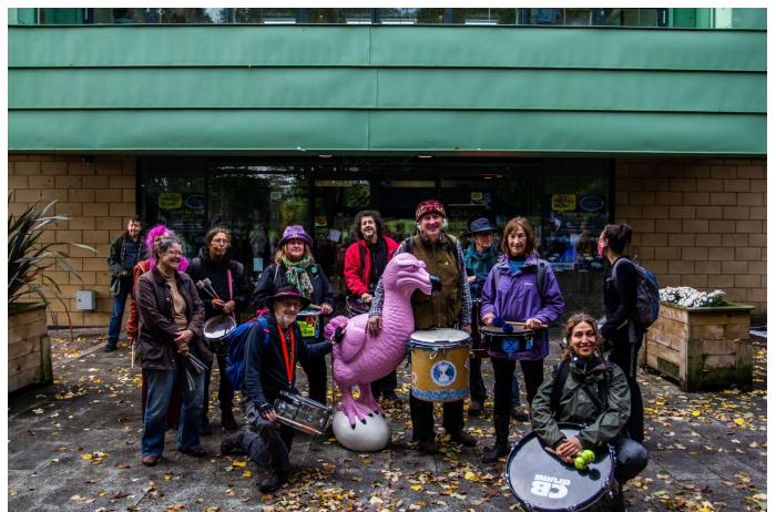
Last 2 pix: © Josh Nicoll - Josh Nicoll Design - @RFE_Design